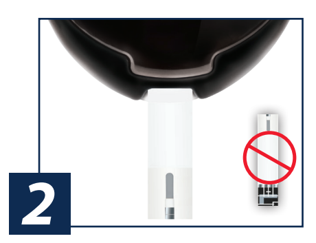
Remove Test Strip from vial and close vial immediately. Insert Test Strip into Test Port with Contact End (blocks facing up). The Meter turns on.