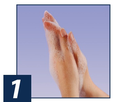
Wash your hands with warm, soapy water.