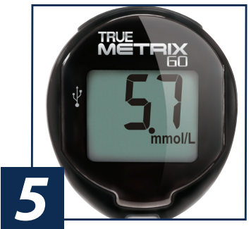
In as fast as 4 seconds, glucose result will be displayed. Discard Test Strip in the appropriate container.