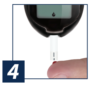
With Test Strip still in Meter, touch Sample Tip to top of blood drop and allow blood to be drawn into Test Strip. Remove from blood drop immediately after dashes appear across Meter Display.